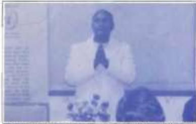
Sri Chinmoy leads 1984 observance of Seven Minutes of World Peace at United Nations Headquarters.