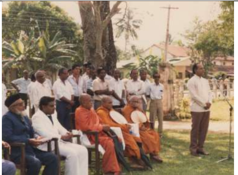
1985-10-oct-24-seven-min-world-peace-sri-lanka-scaled.jpg – 571 KB