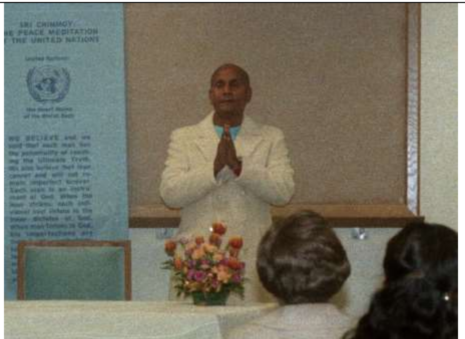
1984-10-24-03-seven-minutes-for-world-peace-Sri-Chinmoy-leads-meditation-UN-conference-room-crp4.jpg 998 KB use crp 2?

Seven Minutes of Silence for peace over many years also took place in various Secretariat offices periodically, in some cases weekly, and in several cases, daily.