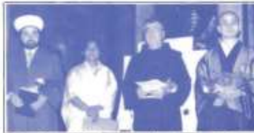
Leaders of various faiths at the State House in Boston after Seven Minutes of World Peace programme in 1984.

Press coverage was extensive in the Netherlands, where there were major articles in the Algemeen Dagblad and the Huigische Courant . Other articles appeared in various publications in the United States.