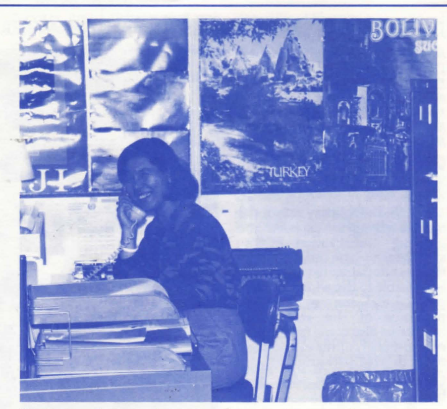
UNDP: Carpeting and private or semi-private working areas show concern for the morale and efficiency of staff.