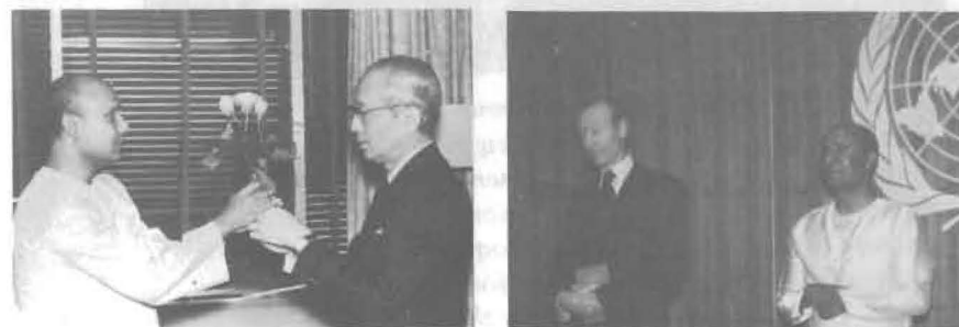
Sri Chinmoy with United Nations Secretaries-General Javier Perez de Cuellar [above], U Thant [left] and Kurt Waldheim.

—Secretary-General Javier Perez de Cuellar in an address to the Meditation Group