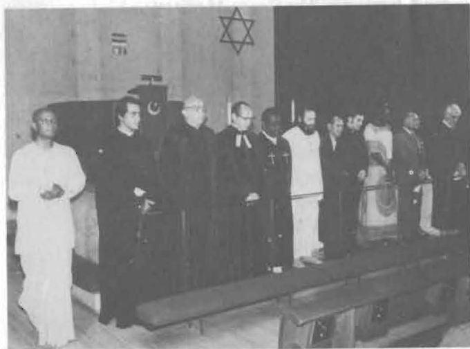
Meditation Group programmes touch on a wide variety of political, cultural and spiritual topics. Here representatives of the world's major faiths meet to commemorate World Prayer Day.

Since 1973 the Meditation Group has published a monthly bulletin, Meditation at the United Nations . It also publishes a bi-monthly newsletter, A Moment's Peace .