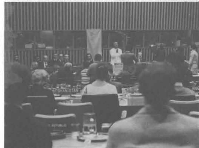
Mrs. Martin Luther King, Jr., wife of the slain U.S. civil rights leader, joins in a moment of silence before offering some personal insights into her late husband's vision of world brotherhood.

The Meditation Group also sponsors symposia in which