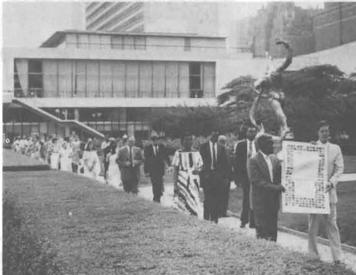
In a two-day "peace walk" commemorating the 38th anniversary of the signing of the U.N Charter, walkers representing different nations pass in relay fashion through the U.N. Gardens in an eloquent testimonial to the universal desire for peace. The walk was sponsored by the Permanent Representatives of a number of U.N. member countries in cooperation with the Meditation Group.

"We believe and we hold that each man has the potentiality of reaching the Ultimate Truth. We also believe that man cannot and will not remain imperfect forever. Each man is an instrument of God. When the hour strikes, each individual soul listens to the inner dictates of God. When man listens to God, his imperfections are turned into perfections, his ignorance into knowledge, his searching mind into revealing light and his uncertain reality into all-fulfilling Divinity."