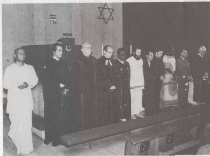
Meditation Group programmes touch on a wide variety of political, cultural and spiritual topics. Here representatives of the world's major faiths meet to commemorate World Prayer Day.

Since 1973 the Meditation Group has published a monthly bulletin, Meditation at the United Nations . It also publishes a bi-monthly newsletter, A Moment's Peace .