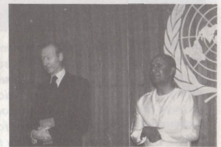
Sri Chinmoy with United Nations Secretaries-General Javier Perez de Cuellar [above], U Thant [left] and Kurt Waldheim.