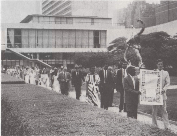
In a two-day "peace walk" commemorating the 38th anniversary of the signing of the U.N Charter, walkers representing different nations pass in relay fashion through the U.N. Gardens in an eloquent testimonial to the universal desire for peace. The walk was sponsored by the Permanent Representatives of a number of U.N. member countries in cooperation with the Meditation Group.

"We believe and we hold that each man has the potentiality of reaching the Ultimate Truth. We also believe that man cannot and will not remain imperfect forever. Each man is an instrument of God. When the hour strikes, each individual soul listens to the inner dictates of God. When man listens to God, his imperfections are turned into perfections, his ignorance into knowledge, his searching mind into revealing light and his uncertain reality into all-fulfilling Divinity."