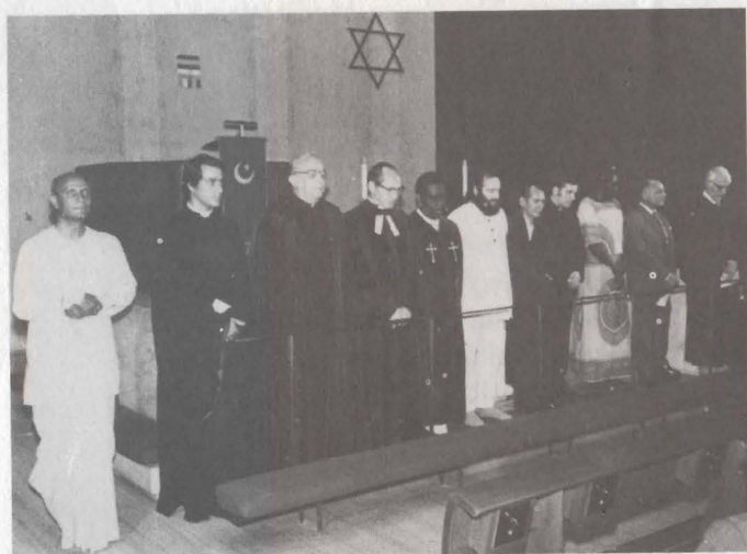
Meditation Group programmes touch on a wide variety of political, cultural and spiritual topics. Here representatives of the world's major faiths meet to commemorate World Prayer Day.

Since 1973 the Meditation Group has published a monthly bulletin, Meditation at the United Nations . It also publishes a bi-monthly newsletter, A Moment's Peace .