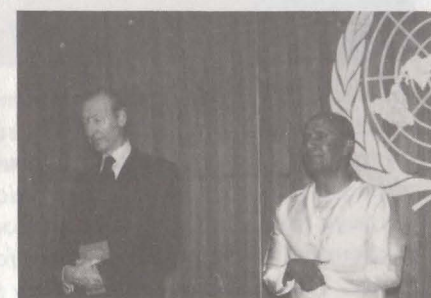
Sri Chinmoy with United Nations Secretaries-General Javier Perez de Cuellar [above], U Thant [left] and Kurt Waldheim.