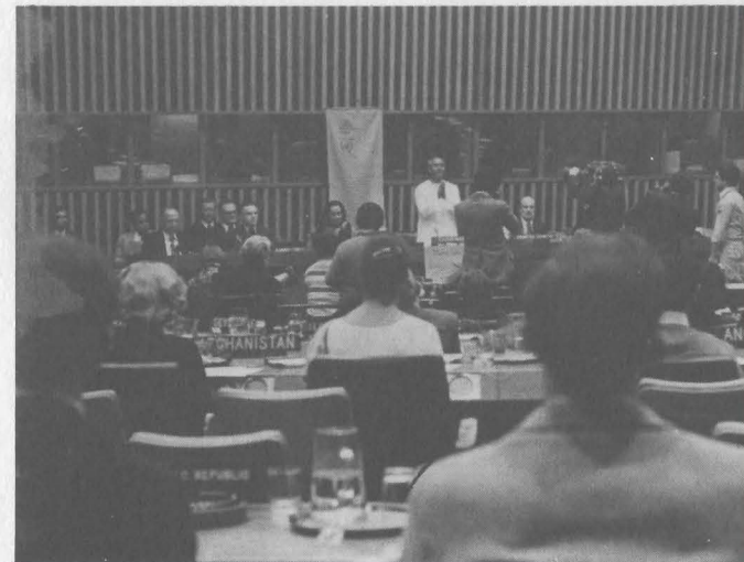
Mrs. Martin Luther King, Jr., wife of the slain U.S. civil rights leader, joins in a moment of silence before offering some personal insights into her late husband's vision of world brotherhood.

The Meditation Group also sponsors symposia in which