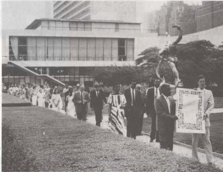
In a two-day "peace walk" commemorating the 38th anniversary of the signing of the U.N Charter, walkers representing different nations pass in relay fashion through the U.N. Gardens in an eloquent testimonial to the universal desire for peace. The walk was sponsored by the Permanent Representatives of a number of U.N. member countries in cooperation with the Meditation Group.

"We believe and we hold that each man has the potentiality of reaching the Ultimate Truth. We also believe that man cannot and will not remain imperfect forever. Each man is an instrument of God. When the hour strikes, each individual soul listens to the inner dictates of God. When man listens to God, his imperfections are turned into perfections, his ignorance into knowledge, his searching mind into revealing light and his uncertain reality into all-fulfilling Divinity."