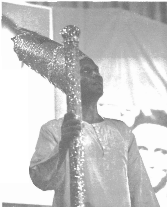
Sri Chinmoy during his performance of The Son .

of the major cities in New York, Connecticut, California and Puerto Rico, as well as his remarkable solo performance of scenes from his own play The Son, in which he portrayed both the Supreme and the Christ.