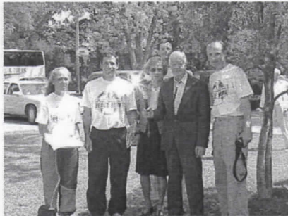
Former US President Jimmy Carter with the Peace Torch

Former US President James Earl (Jimmy) Carter and his wife, Roslyn, met the Peace Runners on April 29, as the Run visited their home town of Plains, Georgia. The ex-President held the Torch outside the Maranatha Baptist Church, where he offers a weekly Sunday School Bible class. Mr Carter is best remembered for arranging the 1979 peace agreement between Egypt and Israel. He is also well-regarded for his post-Presidential career as a foreign diplomat. "Meeting him has deepened my appreciation for who he is and