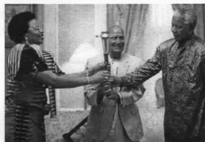
Peace Run founder Sri Chinmoy with former South African President Nelson Mandela and his wife Graça Machel

Olympic gold medalist Carl Lewis has run with the torch through Houston, and fellow Olympic champion Cathy Freeman has taken it in Melbourne. Countless leaders have held