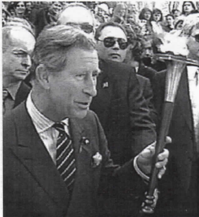
His Royal Highness Prince Charles takes a step for peace