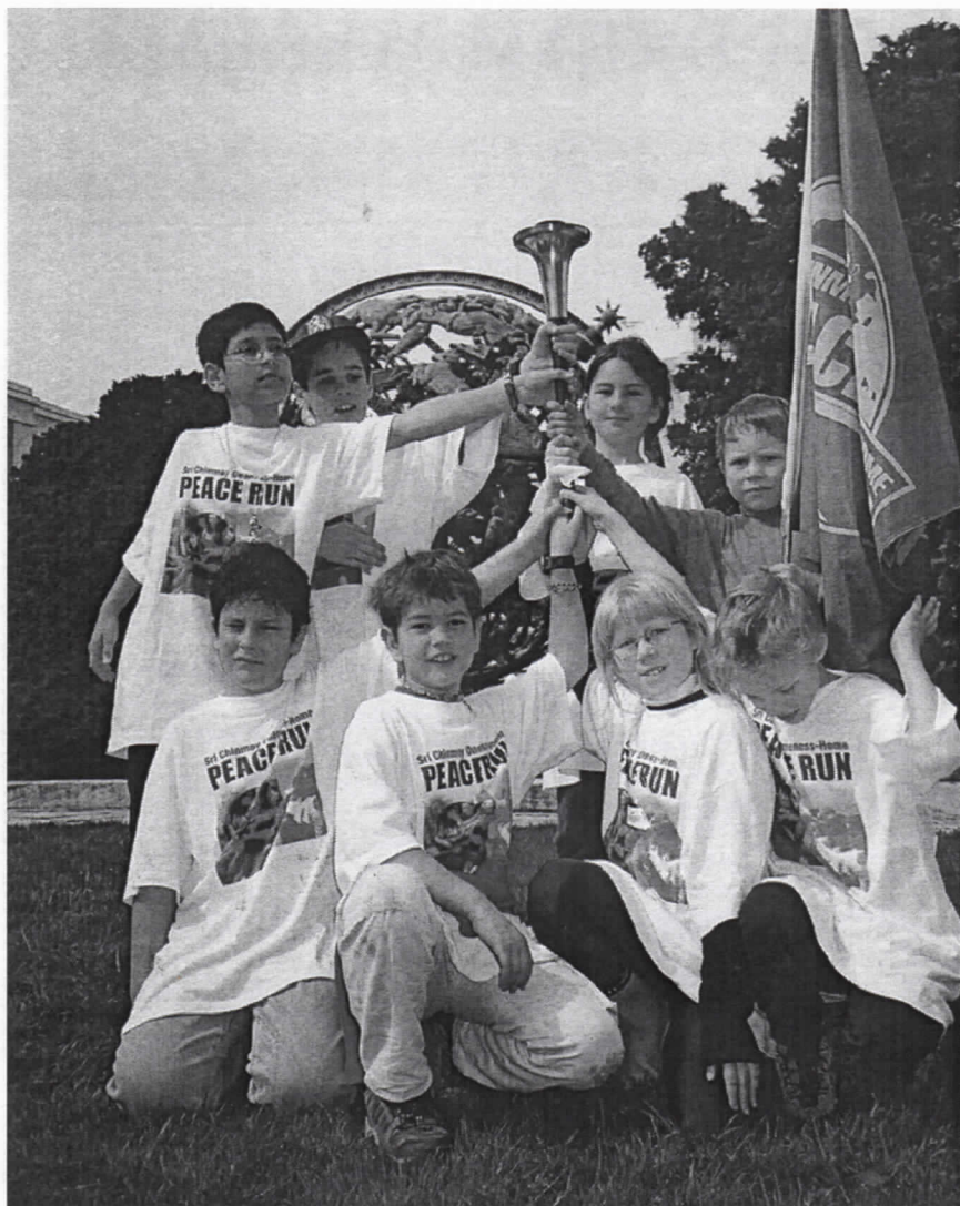
Children participating in the recent Geneva Peace Run ceremony in Switzerland.