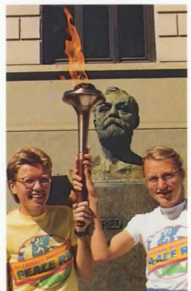
Marathoners Ingrid Kristiansen and Grete Waitz pause before the statue of Alfred Nobel in Oslo