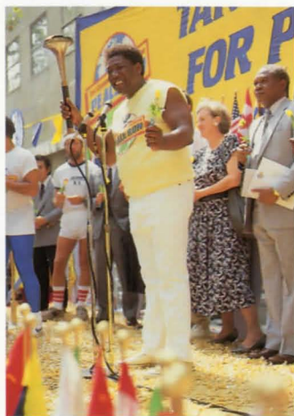
Rock musician Clarence Clemons