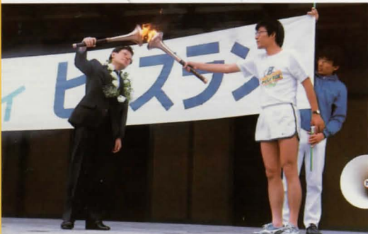
The Peace Run in Japan was front page news as runners covered the length of the nation.

Archbishop Desmond Tutu Winner, Nobel Peace Prize