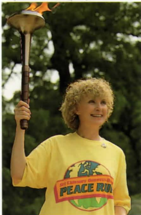
Actress Joanne Woodward

I commend the organizers of the Sri Chinmoy Oneness-Home Peace Run for undertaking this historic initiative and wish the very best to all those who are taking part the world over.