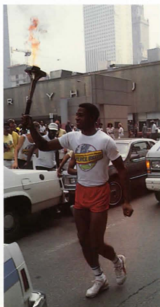
American football great Willie Gault passing through Chicago