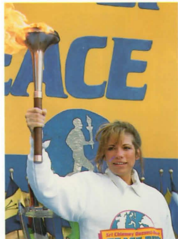
Singer Carly Simon at the opening ceremonies of the 1987 Peace Run