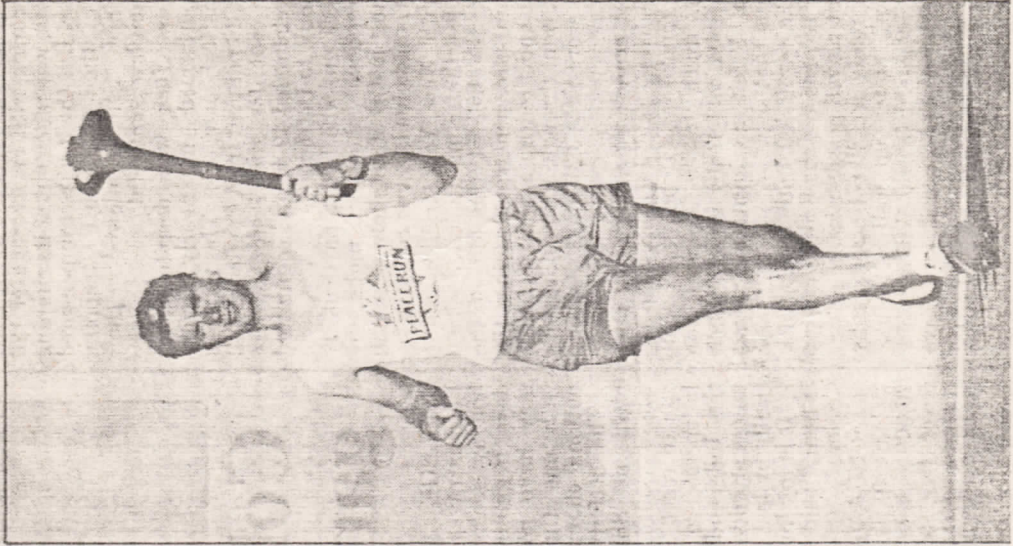
Holding high the Torch

And, without any doubt, Thailand is also highly privileged to be an intrinsic part of such a unique crusade.