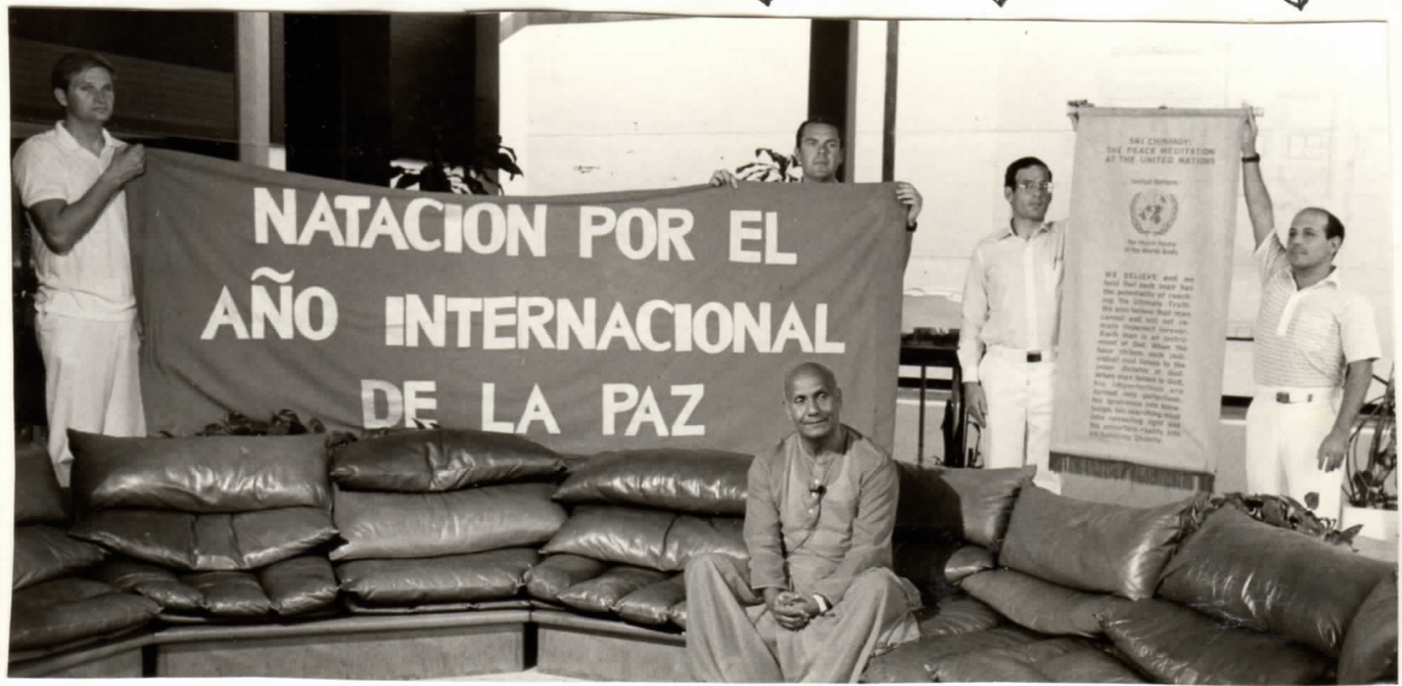
↑ SRI CHINMOY