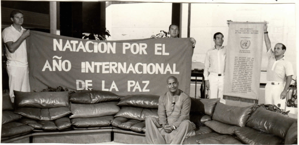
↑ SRI CHINMOY