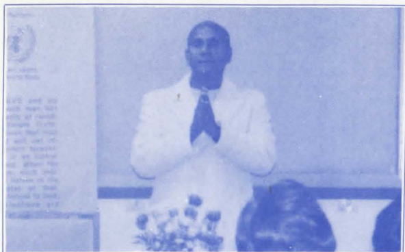
Sri Chinmoy leads 1984 observance of Seven Minutes of World Peace at United Nations Headquarters.