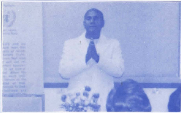
Sri Chinmoy leads 1984 observance of Seven Minutes of World Peace at United Nations Headquarters.