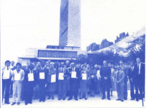
Members of U.N. delegations holding some of the proclamations sent by more than 60 mayors of America's principal cities.