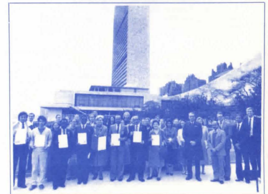
Members of U.N. delegations holding some of the proclamations sent by more than 60 mayors of America's principal cities.

—Brian Mulroney— Prime Minister of Canada