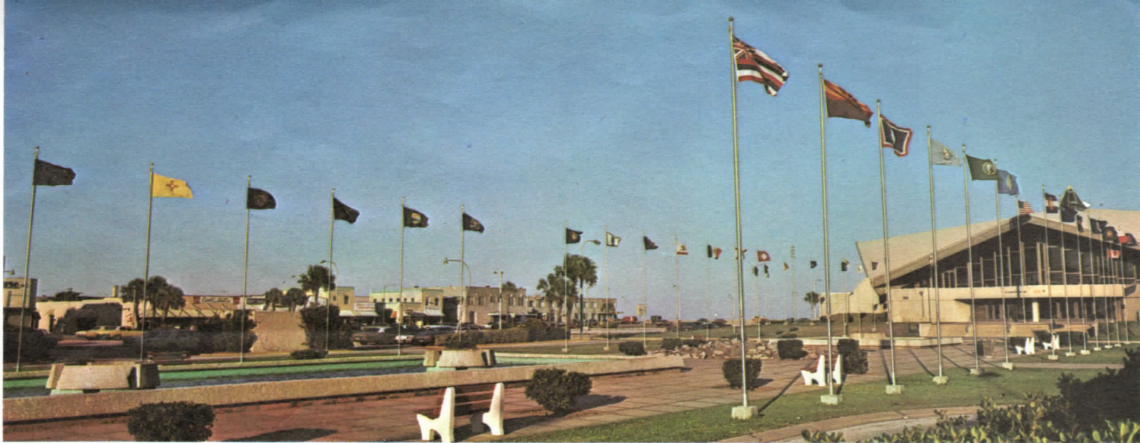
BICENTENNIAL FLAG PAVILION — JACKSONVILLE BEACH, FLORIDA, U.S.A.